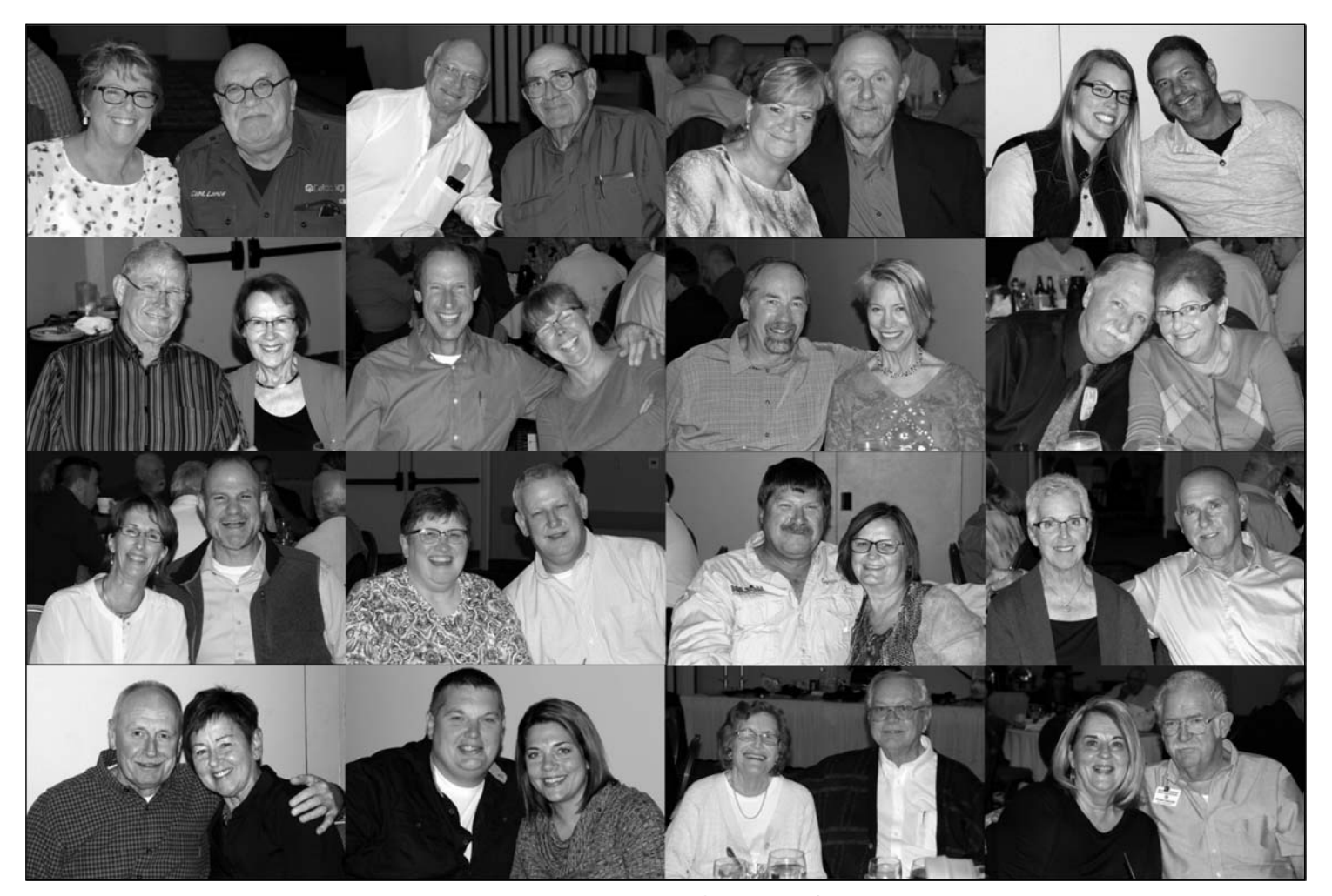
(Continued from page 9) . . . MCBA Vice President

attended the Lake Michigan Citizens Advisory Committee meeting in October. Good news is that the DNR bottom trolls are showing more alewives in the near shore depths of 40' to 120' deep. Deep water trolls are pretty much showing dead-sea.