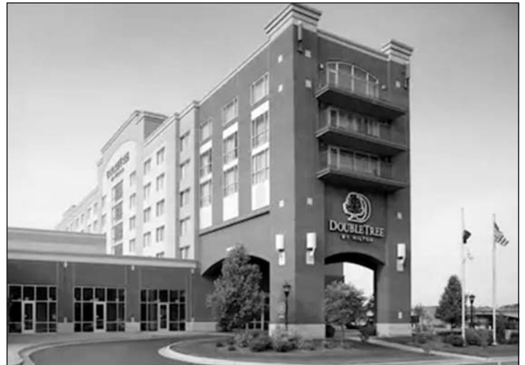
DoubleTree by Hilton Hotel Bay City - Riverfront One Wenonah Park Place - Bay City, Michigan, 48708 Ph.: 989-891-6000 - Group Code: ABS

Of course, attendance at this event is strictly optional, but it is a great way to start your weekend at the MCBA conference. And you might get a chance to talk to someone in the